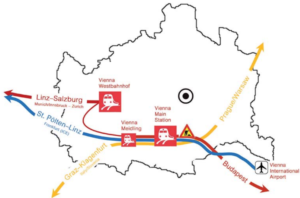
ÖBB long-distance routes excluding overnight and motorail trains

The new system starts on 14 December 2014